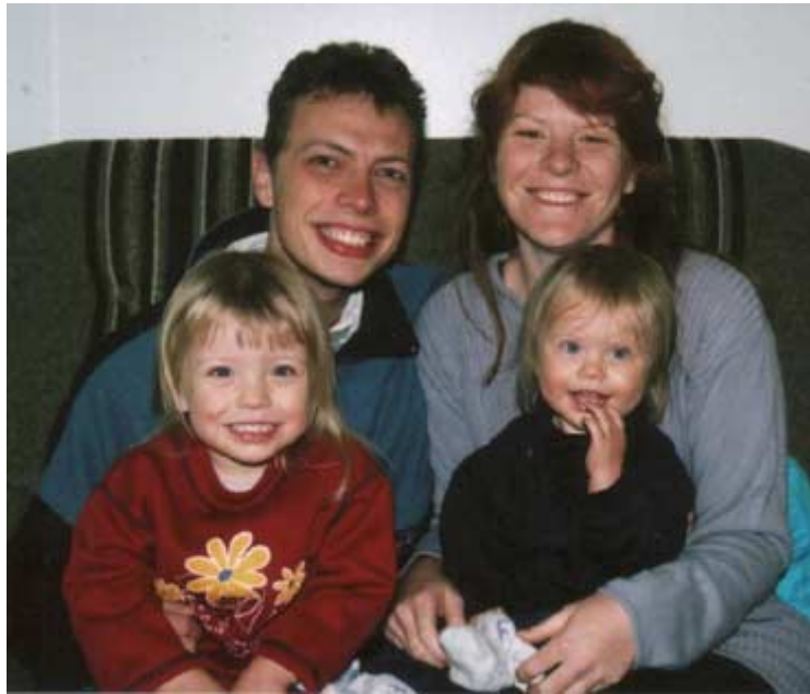
Me and my Fantastic Family!

My biggest goal is to retire and spend more time with my family everyday.